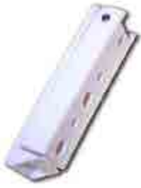
BAGGAGE PLASTIC DOOR CATCH 008067

Keeps baggage compartment open. Catch mounts on vehicle and allows easy, trouble free access.