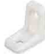
COMERANGLE BARS - WHITE 008158