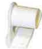
SNAP IN MUSLIN BRACKET 007786

Use screws or double sided tape to attach to wall or ceiling.