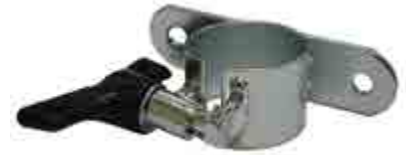
SWING AWAY COLLAR FOR TABLE LEG 007897

Replacement swing away collar for table leg (refer code 007892).