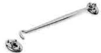
CABIN HOOK 008182 75MM WITH EYE 008183 100MM WITH EYE 008185 150MM WITH EYE 008186 200MM WITH EYE 008187 CABIN HOOK EYE