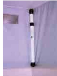
POP TOP INTERIOR SUPPORT 035303

Internal support for pop top camper roof.