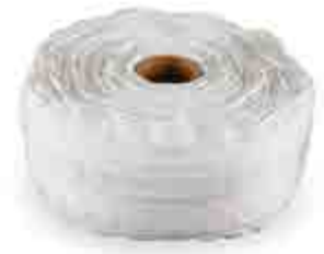
GATHERING TAPE NATURAL 007810 ER METRE