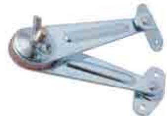
WINDOW STAY 802 008014 SMALL 008013 LARGE

This folding stay is available in two sizes and was often used as a window stay in older caravans.