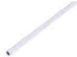
EXPANDING PLASTIC COATED WIRE 007775