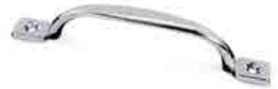
GRAB HANDLE 007977 100MM CHROME 007979 152MM CHROME