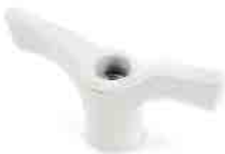
WING NUT - WINEGLASS TABLE LEG 007937

Replacement base for wineglass table leg (refer code 039970). Wing nut not included.