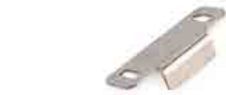
MINI CUPBOARD CATCH STRIKER 008095