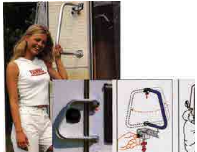
FIAMMA SECURITY DOOR HANDLE 000746 310MM 000747 460MM

Fiamma Helping Hand Door Handle is made of solid aluminium. It serves as a convenient handle to make entering and exiting the vehicle easier. When closed back onto the door, it works as an anti-theft device.