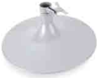
SPLIT BASE - WINEGLASS TABLE LEG LESS WING NUT 007936

Replacement base for wineglass table leg (refer code 039970). Wing nut not included.