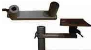
WINEGLASS TABLE SWIVEL ADAPTOR 038519 SHORT 205 X 80 X 100 BLACK 038520 LONG 260 X 80 X 100 GREY

Replacement bracket in two sizes, fits most existing table tubes that are around 45mm in diameter.