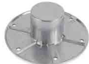
TABLE LEG BASE RECESSED 035548

Replacement top flush plate base to suit tube 55mm in diameter.