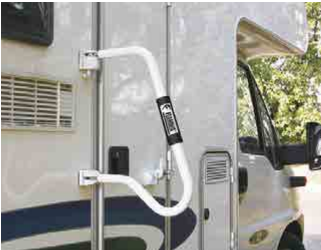
FIAMMA SECURITY 46 PRO HANDLE 034093

Security handles take up little space when folded against wall. They serve as a useful handle to make entering and exiting the vehicle easier. They adapt to all doors, opening both to the right and left. Includes installation brackets, screws and internal counter brackets.