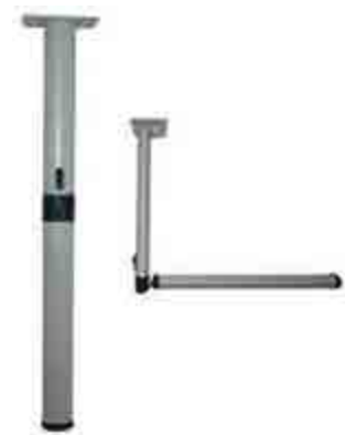
BI-FOLD TABLE LEG 007905

This unique table top hinge set offers versatility and portability. The table top can be lifted from the wall bracket and conveniently positioned elsewhere on the caravan, even outdoors.