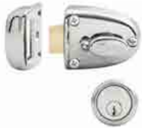
LOCKWOOD 200 STREAM LATCH 008235

Main door lock ideal for narrow door stiles.