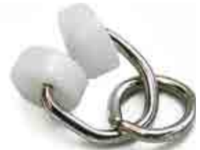
CURTAIN RUNNER (JAYCO) 007808