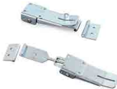
CAMPER ROOF CLAMP LOCKABLE 008267

This clamp is commonly used on pop top caravans and wind up campers to hold down the roof while the trailer is in storage or while travelling.