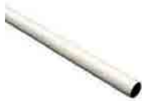
POWDER COATED ROD 007771