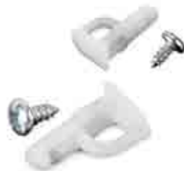
END STOP PUSH IN 007798