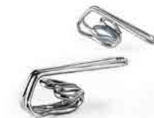
STEEL CURTAIN GATHERING HOOK NO 7 007799