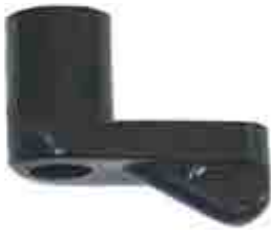
FLY SCREEN TURN BUTTON 5/16 008258 A simple locking device for hinged fly screens. • Black