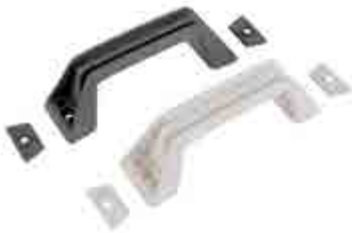
GRAB HANDLE VECAM 007980 GREY 007983 WHITE

A strong plastic grab handle suitable as a pull handle on the corner of caravans or camper trailers. Gasket not included. Please use silicone under the handle and also on the threads of your screws.