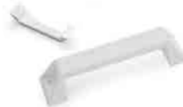
GRAB HANDLE PLASTIC 007988

A strong plastic grab handle suitable as a pull handle on the corner of caravans or camper trailers. Gasket not included. Please use silicone under the handle and also on the threads of your screws.