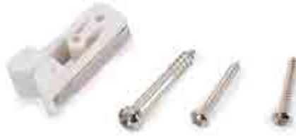
SCREW GRIPPER CATCH 008060