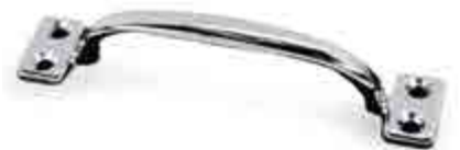
EMRO HANDLE 036752

A strong chrome plated handle suitable as a pull handle on the corner of caravan.