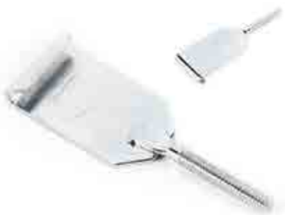
TONGUE - STANDARD ROOF CLAMP 008269

Replacement zinc plated tongue for the standard and locking silver clamp.