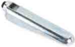
GARAGE LOCK CAST TONGUE 008248