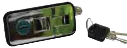
COMPRESS LATCH SMALL FLUSH FITTING 008238