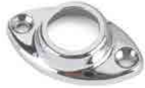
FLANGE RAIL OVAL SHAPE 008202 5/8" - 16MM 008198 3/4" - 19MM To suit coffee tray rails. Chrome plated steel.