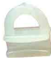
METRO CURTAIN RUNNER 035440

To suit aluminium track (refer code 036495).