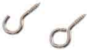
SCREW EYE AND EXPANDING WIRE 007802 SCREW EYE 007803 SCREW HOOK