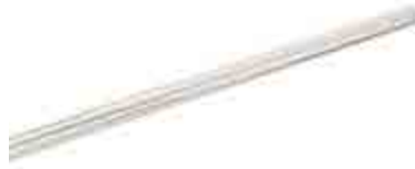
TOWEL RAIL 3.6M 039112 STAINLESS STEEL 16MM 039113 STAINLESS STEEL 19MM 008203 CHROME PLATED 19MM SPECIFICATIONS: • Length: 3.6m

Retaining rail 19mm x 1.8m for narrow shelves. Decorative and functional. For use with pillar ends and throughs. • Nickel