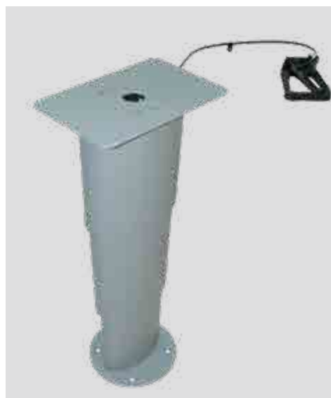
PRIMERO COMFORT TABLE SUPPORT 044429

Replacement recessed base to suit tube 55mm in diameter.