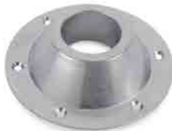
TABLE LEG TOP FLUSH 035547

Replacement top flush plate base to suit tube 55mm in diameter.