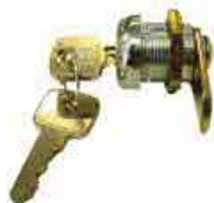
CAMLOCK 008242 LONG THREAD 32MM 035550 SHORT THREAD 28MM