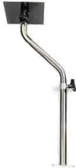
SWING AWAY TABLE LEG 4 PIECE 007892

Replacement wing nut for wineglass table leg (refer code 039970).