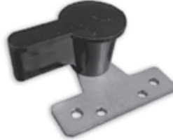
MILLARD POW PLASTIC/METAL LOCK 008553 • Push out window swivel lock • Plastic lever with metal base • Black