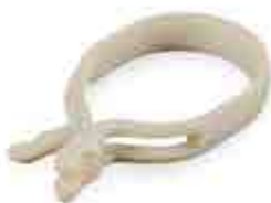
CAFE CURTAIN CLIP 007806 BEIGE