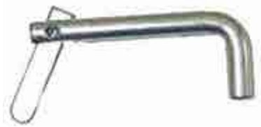
DROP NOSE PIN 008289

This simple locking device has many applications such as securing the raiser arm roof clamp.