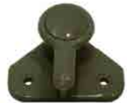
VISCOUNT POW GREY KNOB LOCK 008556 Nylon push out window lock. • Grey