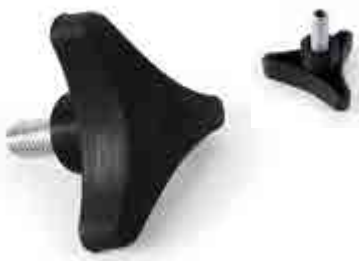
LOCKING KNOB - EASY LIFT LEG 007940

Replacement locking knob with a 3/8" Whitworth thread to suit Eazy lift table leg (refer code 007890).