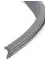
MILLARD/ALFAB POW GLAZE-WEDGE 008552