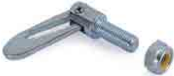
UTILITY FASTENERS BOLT ON 035320