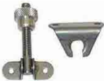
SWINGING BOLT AND PLATE 38MM (2PCE) 007997

FEATURES: • Anti slip grit surface improves footing on step ladders and trailer frames • Dimensions: 50mm(w) x 18m(l) roll