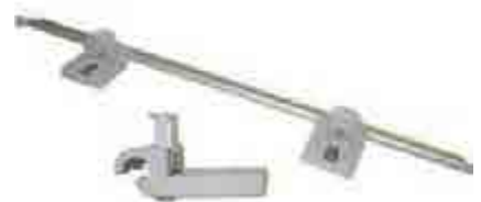
TABLE SLIDE RAIL KIT

For storage of island table leg poles when table is not in use.