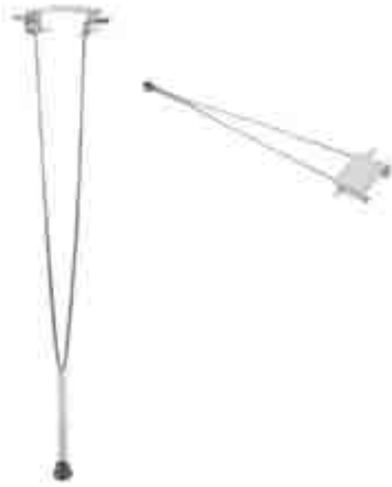
TABLE LEG - V TYPE 007904

These simple "V" shaped, chromed wire legs which lock for vertical support, can pivot horizontally under the table top for ease of storage or when the table top is being used as a bed.