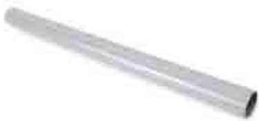
WINEGLASS TABLE LEG TUBE ONLY 007934

Replacement tube for wineglass table leg (refer code 039970).