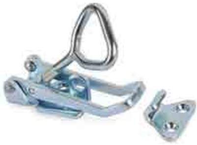
TOGGLE CLAMP WITH PLATE 008276

Special locking catch mechanism prohibits the latch opening accidentally.