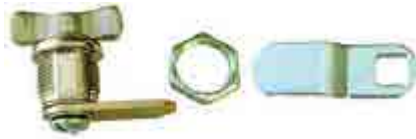
CYLINDER LOCK - NO KEY 008252 • Chrome plated thumb operated camlock for baggage doors • Not lockable • 5/8" wing nut