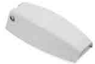
HOLDING CATCH ACCESS DOOR 008161 • White