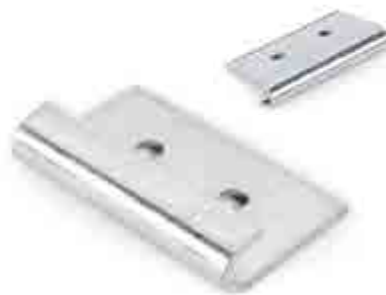
J CLIP - ROOF CLAMP 008270

Replacement J Clip for both standard and locking silver clamps.