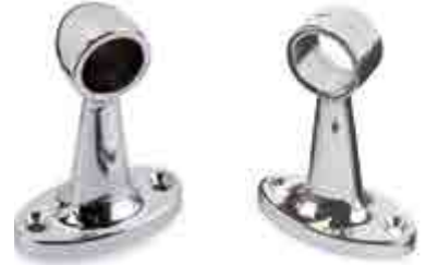
PILLAR END AND CENTRE 008201 PILLAR END 5/8" - 16MM RAIL CHROME 008197 PILLAR END 3/4" - 19MM RAIL CHROME 008223 PILLAR END NICKEL 008196 PILLAR CENTRE 3/4 19MM RAIL CHROME To suit coffee tray rails.