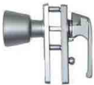
SCREEN DOOR LOCK 008244 Used on camper trailer doors and shower doors. • Silver