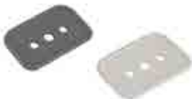
GRAB HANDLE GASKET VECAM 007981 GREY 007984 WHITE

Replacement gasket for grab handle (refer code 007980).