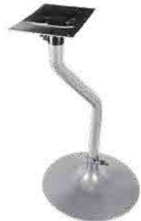
WINEGLASS LEG BENT TUBE 035213