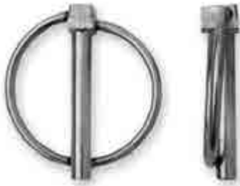
UTILITY LYNCH PIN TRACTOR CLIP B3 8MM 035385