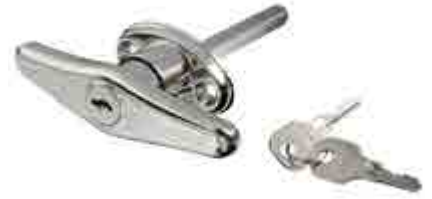
GARAGE DOOR LOCK METAL FRONT FIXING 008246 • Dimensions: 140mm(L) x 30mm(h) x 110mm(d)