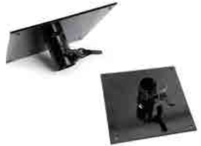
TOP PLATE SWING AWAY TABLE LEG 007895

Replacement swing away collar for table leg (refer code 007892).