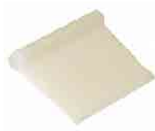
CURTAIN TAB (JAYCO) 007807