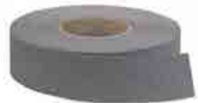
NON SKID GRIP TAPE 000167

FEATURES: • Anti slip grit surface improves footing on step ladders and trailer frames • Dimensions: 50mm(w) x 18m(l) roll