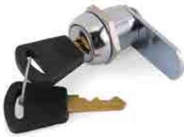
CAMLOCK 008240 SHORT THREAD KEY/ALIKE 16MM 008243 LONG THREAD RANDOM KEYED