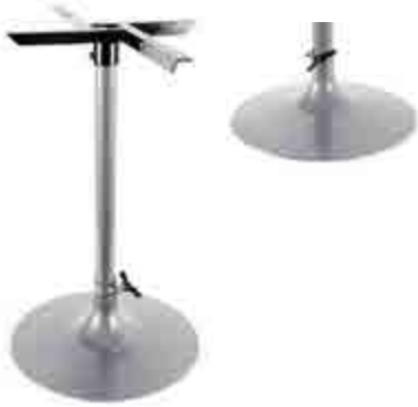
WINEGLASS TABLE LEG ANGLE IRON TOP 007884

A wineglass shaped leg with an angle iron split.