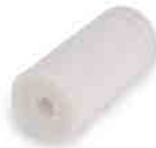
ROUND DOOR STOP AND SCREW 75MM 008228 • White