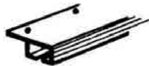
ALUMINIUM MINI TOP GLIDE TRACK (DRILLED) 007779

Clear anodised, drilled without runners.