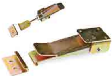
CAMPER ROOF CLAMP STANDARD 008266

Internal support for pop top camper roof.