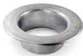
INSERT ROOF COWL 016582 SMALL 75MM 016584 MEDIUM - LARGE 150MM

The roof cowl (outer section) sits on the roof, providing a waterproof vent.