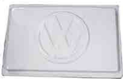
HATCH LID SOPRU VW 550MM X 355MM 035452