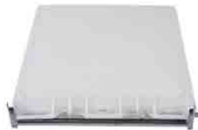
JENSEN LID 14" - NEW STYLE 008583

Replacement lid for Jensen Roof Vent 355mm.