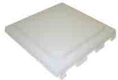
JENSEN LID 14" - OLD STYLE 008582

Replacement lid for Jensen Roof Vent 355mm.