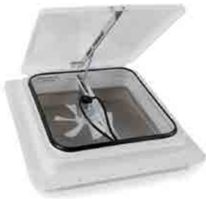
JENSEN ROOF VENT 12V 14" X 14" METAL BASE 008589

Ideal to allow air to flow in and out of the RV.