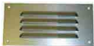
STAINLESS STEEL VENT 016539 SINGLE 127MM X 65MM 016540 SINGLE 127MM X 115MM 016541 SINGLE 127MM X 227MM 016542 DOUBLE 227MM X 115MM

Suitable for cupboards and pantries or any enclosed space that requires ventilation.