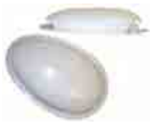
MULLER VENT - PLASTIC 016519