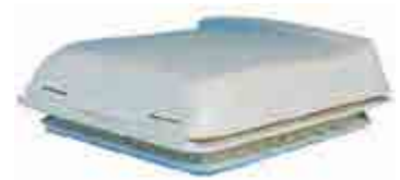
FIAMMA VENT 280MM X 280MM 008640

Ideal for airing small spaces such as bathrooms, the aerodynamic vent is supplied with an air flow ventilation system and insect screen.