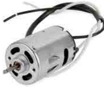
ELIXIR 12V MOTOR 008604