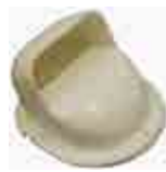
VENT SEA BIRD PLASTIC 016520