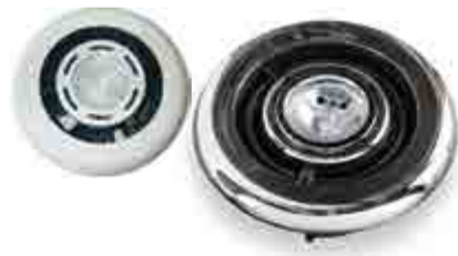
12V EXTRACT FAN AND 10W LIGHT 016536 WHITE 016538 CHROME

Ideal for showers in caravans or motorhomes.