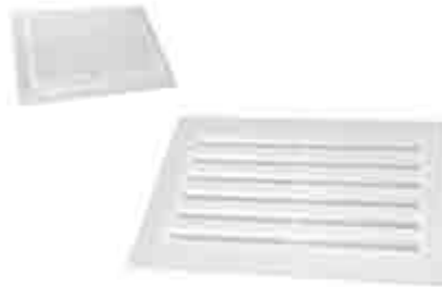
PLASTIC VENT 007973 127MM X 76MM 007965 L4 45MM X 230MM 007971 RL3 145MM X 230MM 007968 RC6 150MM X 230MM 007969 C5 STICK ON 150MM X 230MM 007966 AC44 175MM X 207MM

Suitable for cupboards and pantries or any enclosed space that requires ventilation.