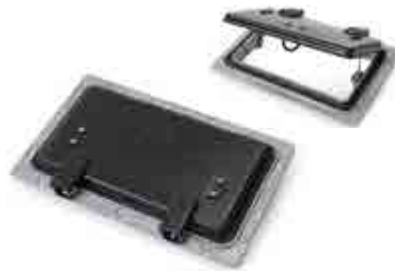
VENT CENTAUR 623 035299 SMALL 190MM X 100MM 016510 MEDIUM 215MM X 165MM

Black Centaur 623 vents are ideal for caravans and RV vehicles.