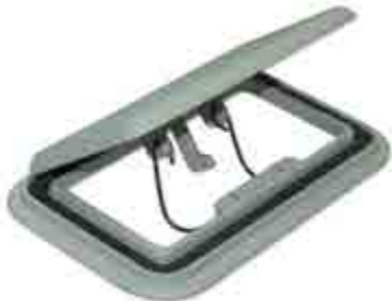
SCUPPER VENT LARGE - WHITE 016554

Used to scoop in air under pressure from forward travel. Suitable for RV vehicles.