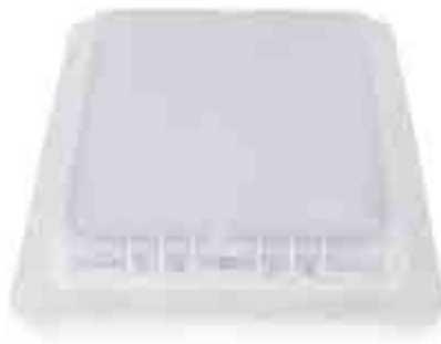
JENSEN ROOF HATCH 400MM X 400MM METAL BASE (14" X 14") 008581

Ideal to allow air to flow in/out of RV vehicle.