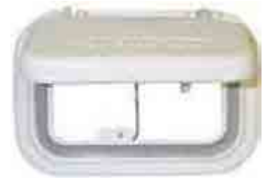
SCUPPER VENT SMALL 016550

Used to scoop in air under pressure from forward travel. Suitable for RV vehicles.