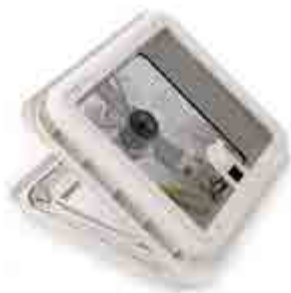
FIAMMA TURBO VENT 280MM X 280MM WITH FAN 008641 WHITE 040826 CRYSTAL

Ideal for airing small spaces such as bathrooms. The aerodynamic vent is supplied with fan, and with an air flow ventilation system and insect screen.