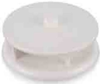
ROTARY VENT HODGES 016543 PLASTIC 016544 METAL