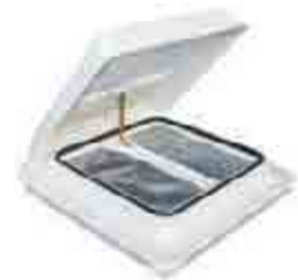
FIAMMA TURBO VENT PRO HATCH 008645

Compact with transparent grating permits maximum airflow and passage of light. Sturdy outside fibreglass net prevents accumulation of leaves and other debris.