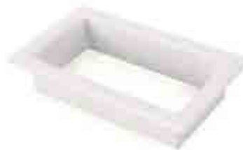
SCUPPER VENT INTERNAL TRIM 016561 SMALL TRIM 40MM ROOF THICKNESS 016563 LARGE TRIM 40MM ROOF THICKNESS 016562 LARGE TRIM 50MM ROOF THICKNESS

Used to scoop in air under pressure from forward travel. Suitable for RV vehicles.