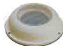
SOLAR EXHAUST VENT PVC 008563