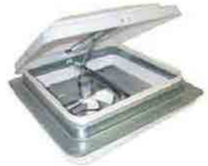
ELIXIR 12V ROOF VENT 14" X 14" METAL BASE 008603

This roof vent is fitted with a 12V fan to extract unwanted steam and exhaust fumes. Ideal for caravans or motorhomes.