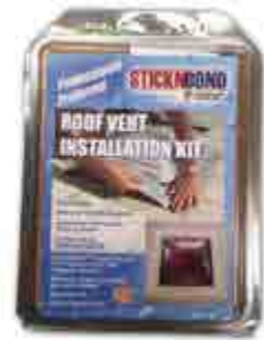
ROOF VENT INSTALLATION KIT 38-8444 043186

Safe for all vents and skylights, plus works on all types of roofs and surfaces (except silicone). Eliminates messy roof coating and paint brushes - just peel and stick.