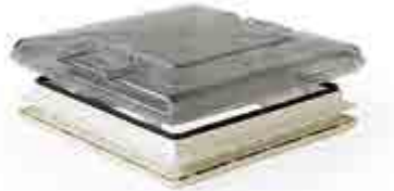
FIAMMA CRYSTAL VENT 500MM X 500MM COMBI WITH ROLLER BLIND 008636 CRYSTAL 008637 WHITE

Opens on all four sides with practical handles. Maintains constant ventilation in the vehicle. Available with a standard roller blind with two rollers, one blackout and one with fly screen.