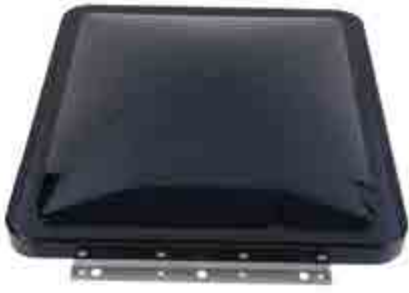
FANTASTIC VENT NEW LID 008652

Replacement lid for Fantastic roof vents. Easily identifiable by grooved/slotted hinge spigots.