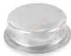
ALI ROOF COWL 016581 SMALL 100MM 016583 MEDIUM 150MM 016585 LARGE 203MM

The roof cowl (outer section) sits on the roof, providing a waterproof vent.