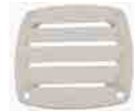
FLUSH PLASTIC VENT 016530

Suitable for lockers, doors, cupboards. Flush mounted.