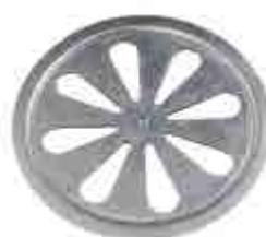
ROSE VENT 016548 PLASTIC 016549 ALUMINIUM