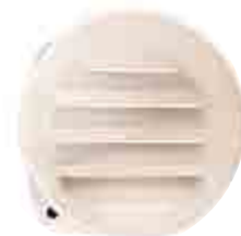
BLOWER VENT 90MM X 90MM 016533