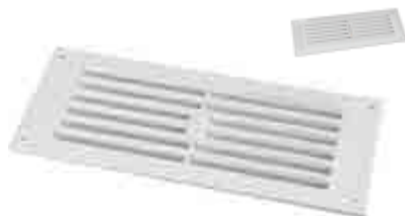
PLASTIC LOUVRE VENT 016527 125MM X 260MM BLACK 016528 125MM X 260MM WHITE 016525 70MM X 445MM BLACK

Suitable for cupboards and pantries or any enclosed space that requires ventilation.