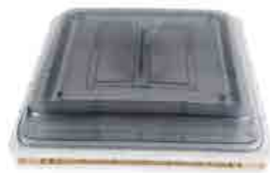
FIAMMA CRYSTAL HATCH 400MM X 400MM (14" X 14") 008617

Simple and functional ventilation system. Can be left open while traveling and provides ventilation even when closed.