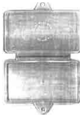
REGO LABEL HOLDER PLASTIC RECTANGULAR 000565

Suitable for mounting next to a number plate on trailers and caravans.