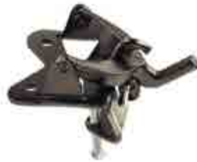
HAYMAN REESE SNAP-UP BRACKET ONLY (21120) 035311