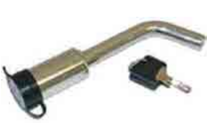
PULL PIN HITCH LOCK PRIME 18-2058 036448

Keeps the tow hitch secure with a lockable pull pin.