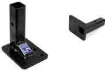
HAYMAN REESE TOWBALL MOUNT PINTLE HOOK 195MM LONG (21166) 035295

Pintle Hooks are the alternative to the standard 50mm towball. Pintle Hooks are particularly used in commercial applications.