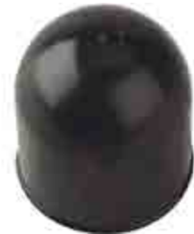
BLACK PVC TOWBALL SOFT COVER 000849

Push on towball covers provide protection from grease.