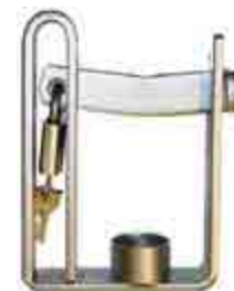
COUPLING LOCK - COUPLEMATE DUAL FOR CAR AND TRAILER 000392

Packing washer used to increase the height of the towball in relation to the wing