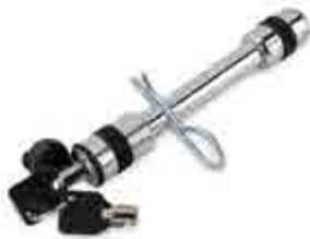
ARK/HAYMAN REESE LOCKABLE PULL PIN 000913

Pull pin is straight for easier access in some towbars. Enables you to lock your towball mount onto the towbar preventing theft.