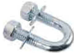
HAYMAN REESE U BOLT KIT (55455BL) 000908