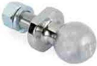
TOWBALL - MACHINED 006252

Standard towball size with long shank to allow stabiliser bar or bike rack to be fitted.