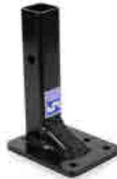
PINTLE HOOK ADAPTOR (21199) 000889

To suit heavy duty 50x50mm hitch receiver towbars. Maximum load: 3500kg.