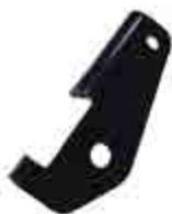
FRICTION SWAY TOWBALL ADAPTOR FOR HAYMAN REESE FRICTION SWAY CONTROL 043273