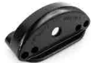
CAST HEAD - 4-BAR EQUALIZER PAINTED BLACK 000818

Suitable for mounting next to a number plate on trailers and caravans.