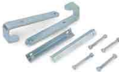
EQUALIZER 6" A-FRAME BRACKET KIT 000822

Galvanised equalizer bracket set for use if your A-frame is more than 100mm deep. Suits 6" (150mm) A-frames.