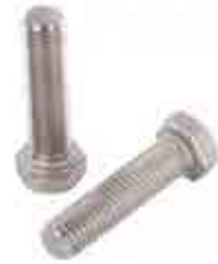
HAYMAN REESE 1/2" X 2" UNC BOLT SET (55060) 000910