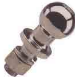
TOWBALL - MACHINED 006255

Large ball size, extra long shank for fitting stabiliser blocks and bike racks etc.