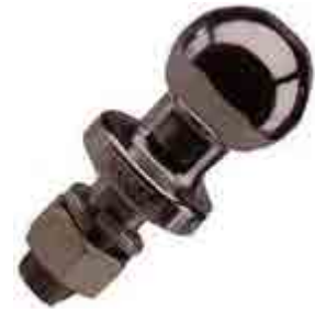
TOWBALL 3T - MACHINED 036443