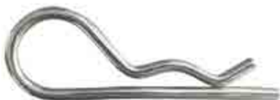
R CLIPS 000811 3MM FOR RV TOWAID 000812 4MM

Adjustable mechanical aid to assist placing equalizer rods into chassis brackets - saves back muscles.