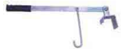
BACKSAVER - CLASSIC RV TOWAID 000407

To suit heavy duty 50x50mm hitch receiver towbars. Maximum load: 3500kg.