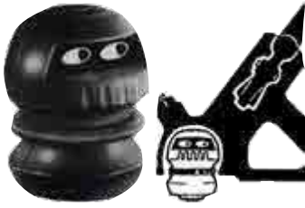
COUPLING LOCK TRAILER COP 000385

Quick release expanding towball coupling lock, fits all popular trailer couplings with a barrel lock for high security.