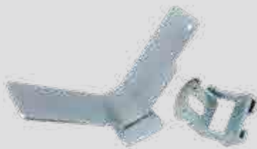
COUPLEMATE BALL ATTACHMENT AID