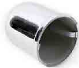
CHROMED PLASTIC TOWBALL COVER 000850

Used for towball nuts, snap-up bracket bolts, D shackles, towbar tongue bolts and adjustable ball mount bolts and nuts.