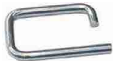
HAYMAN REESE SAFETY PIN-SNAP-UP BRACKET (55180) 000911

Stops snap up bracket from disengaging. Suit Hayman Reese weight distribution hitch.