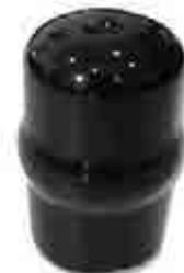
PLASTIC TOWBALL COVER BLACK HARD 000848

Designed for use with Alko stabiliser coupling.