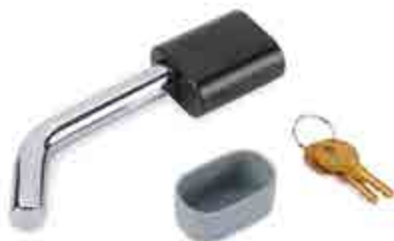
COUPLMATE HITCH PIN LOCK 65MM 000933

For use with a trailer lock to replace existing pin.