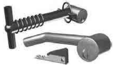
PULL PIN HITCH LOCK + TREG LOCK 036450

Used to lock a 4WD Treg or Trigg coupling to a vehicle.