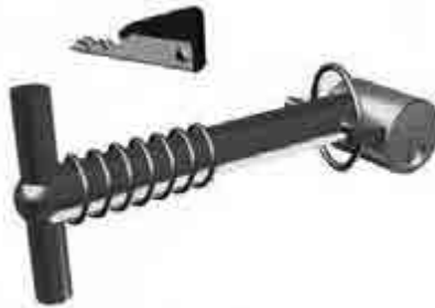
PULL PIN LOCK S TREG TALON 036449

Used to lock a 4WD Treg or Trigg coupling to a vehicle.