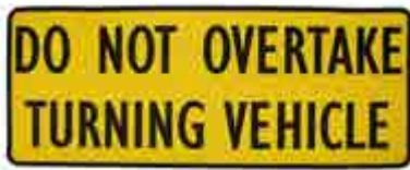
DO NOT OVERTAKE TURNING VEHICLE STICKER 042870

If your tow rig is near 7m long, a sign like this should be displayed on the back of your vehicle.