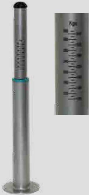
CAMEC BALL WEIGHT SCALE 043231