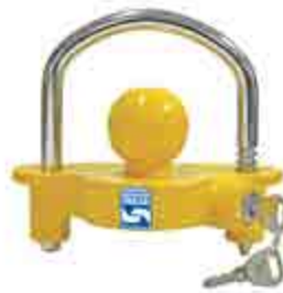
COUPLING LOCK WITH 2 KEYS 042847