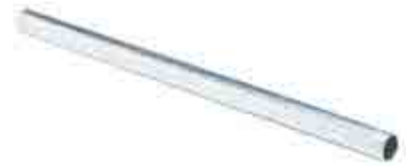
HAYMAN REESE SNAP UP BRACKET HANDLE (55050) 000912