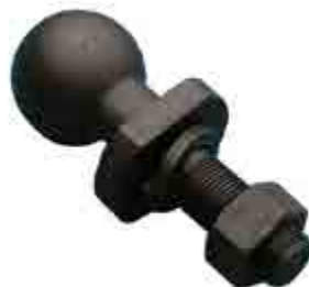
ALKO 50MM TOWBALL 036775

Designed for use with Alko stabiliser coupling.