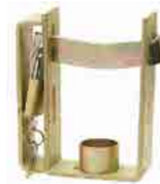
COUPLING LOCK AND PADLOCK - DUAL PLATED WITH PADLOCK DELUXE 000395

Secures trailer when attached or not attached to a vehicle.