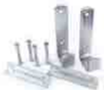
EQUALISER A-FRAME BRACKET KIT 000820

Replacement equaliser brackets and B-plates (with bolts) for those that forget to remove the brackets. Pack of 2.