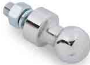
TOWBALL HIGH RISE - MACHINED 006254

High rise towball size with 25mm shaft, long shank to allow stabiliser bar or bike rack to be fitted.