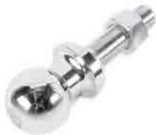
TOWBALL - MACHINED 006250

Standard ball size, extra long shank for fitting stabiliser blocks and bike racks, etc.