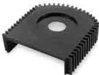
SHIN PROTECTOR ARK TP11 039991

Made from soft rubber, fits securely over towbar goose neck.