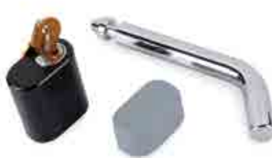
COUPLMATE STAINLESS STEEL HITCH LOCK 85MM 000934

For use with a trailer lock to replace existing pin.