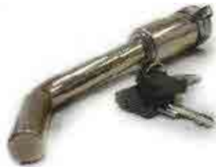
HAYMAN REESE HITCH LOCKABLE PULL PIN 000914

Enables you to lock your trailer ball mount onto the towbar preventing theft.