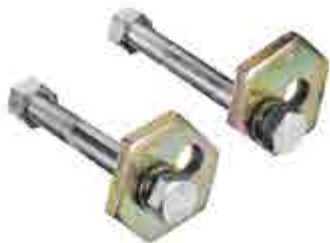
BOLT KIT FOR HAYMAN REESE (70011) 000925

Replacement bolt kit to suit Hayman Reese adjustable ball mount.