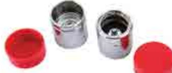
BEARING BUDDIES 006574