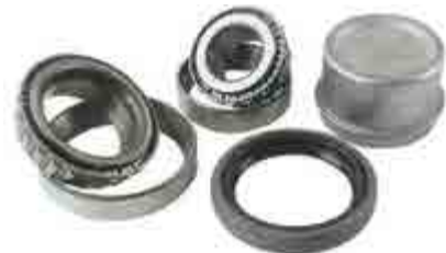
BEARING KIT 006565