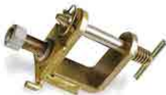
U BRACKET AND SPRING 006295

Suits electric brakes. Quick release, 4 hole bolt on, 3500kg max load.