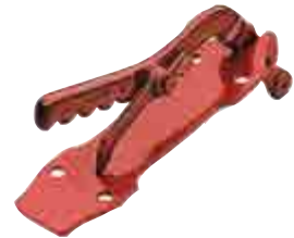
ANTI SWIVEL BASE PLATE 036220