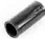
NYLON BUSH 006535