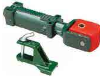
TRIGG COUPLING 4WD 006302