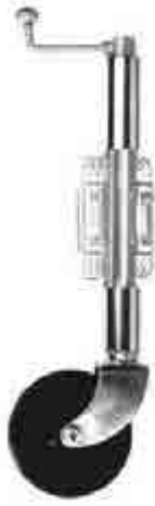
JOCKEY WHEEL 036244 6" SMALL BRACKET 006410 8" LARGE SWIVEL PLATE

Features an attached swivel bracket which will lock in the vertical or horizontal position. The jockey wheel can be welded or attached over a 100mm x 50mm A-frame using a U-Bolt kit.