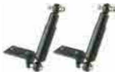
AL-KO SHOCK ABSORBER KIT 036423