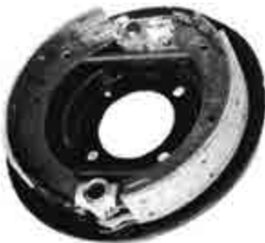
BRAKE ASSEMBLY 006340