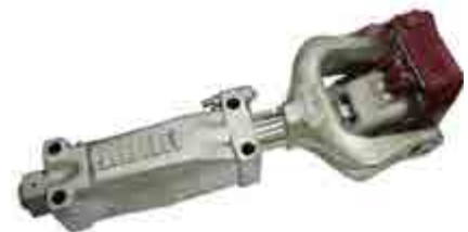
4WD COUPLING 040837