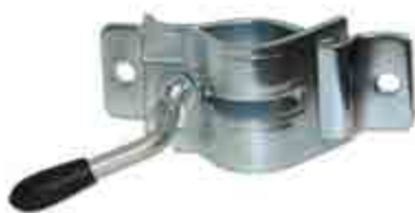
CLAMP ONLY FOR CAMEC JOCKEY WHEEL 043250

Jockey Wheels with swivel clamps, plates or brackets. Solid tyre.