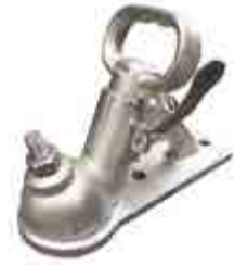
QUICK RELEASE COUPLING 036199