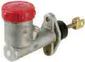
HYDRAULIC MASTER CYLINDER 006346