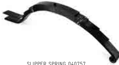
SLIPPER SPRING 040757