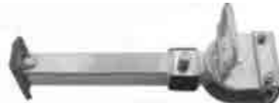
ADJUSTABLE DROP DOWN LEG 034280