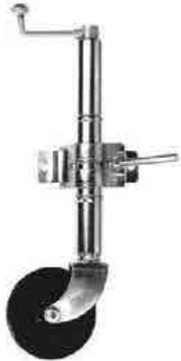
JOCKEY WHEEL - 8" (200MM) 042352 AL-KO STANDARD NO CLAMP 8" 200MM AL-KO 006408 STANDARD WITH CLAMP 8" 200MM 038561 AL-KO STANDARD WITH SWIVEL PLATE 350MM X 410MM 038556 AL-KO STANDARD WITH CLAMP 350MM X 410MM 006415 AL-KO STANDARD WITH WELD ON CLAMP 8" 200MM 006416 AL-KO STANDARD WITH SMALL SWIVEL PLATE 8" 200MM 036248 MANUTECH HEAVY DUTY WITH LARGE SWIVEL CLAMP 8" 200MM

Features an attached swivel bracket which will lock in the vertical or horizontal position. The jockey wheel can be welded or attached over a 100mm x 50mm A-frame using a U-Bolt kit.