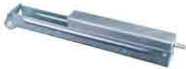
ADJUSTABLE FRONT LEG 006470