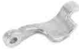
REVERSING CATCH 036221