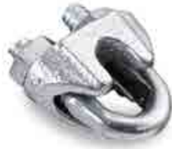
BRAKE CABLE THIMBLES