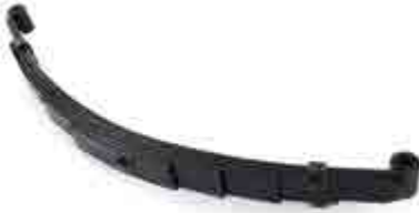
TANDEM LEAF SPRING 036309