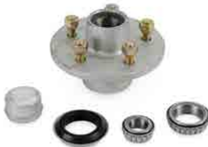
GALVANISED HUB KIT 040629