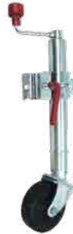
JOCKEY WHEEL - 6" (150MM) 006404 AL-KO STANDARD NO CLAMP 6" 150MM 006406 AL-KO STANDARD WITH LARGE SWIVEL BRACKET 6" 150MM

Jockey wheels with swivel clamps, plates or brackets.