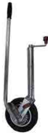
POWER MOVER WITH SOLID WHEEL (AL-KO) 038543 000464 SPARE HANDLE

A most efficient caravan mover featuring original dual pawl ratchet system. This model can be mounted on either side of the drawbar, thereby allowing maximum manoeuvrability. It is fitted to the normal jockey wheel bracket and can be wound up to a height of 840mm.