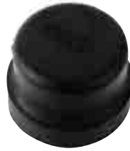
RUBBER DUST CAP 036478