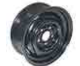
STEEL ROAD WHEEL, SUIT HOLDEN HQ 036452