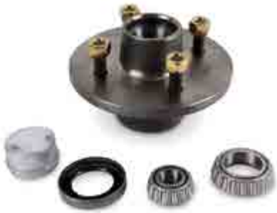
NON BRAKED HUB 036088