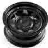
STEEL ROAD WHEEL 036455

The fastest way to ensure your motor vehicle, boat trailer, caravan, camper or box trailer stays secure. Fits up to 290mm wide wheels. Hardened steel and weighs under 3kg.