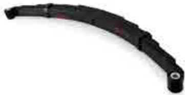
7 LEAF SPRING 040754