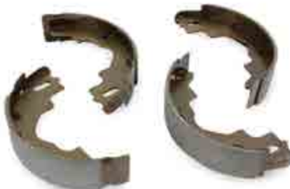
BRAKE SHOES 040625