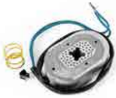
10" OVAL, SUITS HAYES AND AL-KO 006384