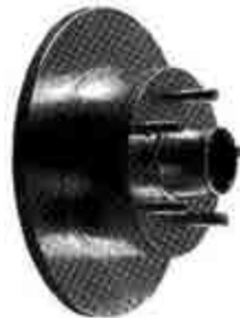
DISC BRAKE HUB 036166