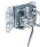
SWIVEL CLAMP AL-KO BOLT ON 036263