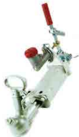
OVERRIDE COUPLING 006281