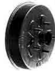
HUB DRUM KIT 036128