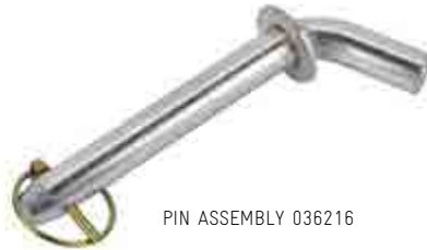
PIN ASSEMBLY 036216