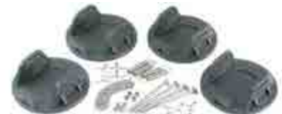
CORNER STEADY PADS 006486