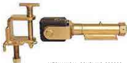
MECHANICAL COUPLING 006300