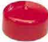
BEARING BUDDY COVER 006575