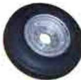
ALLOY WHEEL (VELOX) HUB MOUNT WITH TYRE 036470