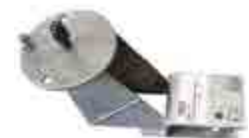
SPARE WHEEL MOUNT JAYCO BOLT ON 000515