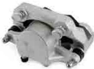
HYDRAULIC DISC BRAKE CALIPER 034170