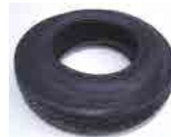
RUBBER TYRE 036480