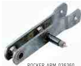
ROCKER ARM 036360

006535 NYLON BUSH 1 3/4 X 9/16 X 3/4IN 036386 NYLON BUSH 60MM X 7/8 X 5/8IN 038810 SHACKLE BOLT AL-KO GREASEABLE, M16 038532 SHACKLE PLATE AL-KO BLACK, M16 036379 SHACKLE PLATE GALVANISED, 9/16" HOLES, 75MM CENTRE TO CENTRE 006526 SHACKLE PLATE 9/16" HOLES, 75MM CENTRE TO CENTRE 036378 SHACKLE PLATE GALVANISED, 1/2" HOLES, 65MM CENTRE TO CENTRE 006576 LUBRIMATIC MARINE GREASE 4546M TUB 006579 HIGH TEMP BEARING GREASE 5006M TUB