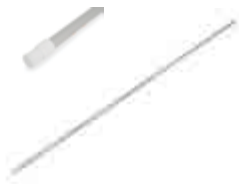
CAMLOCK TV/POOL POLE ALUMINIUM - 25MM 002357

Aluminium Camlock action. Lightweight and compact.