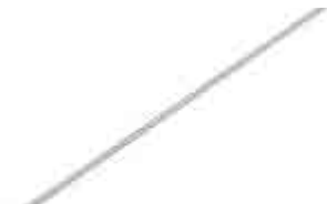
CAMLOCK TV/POOL POLE ALUMINIUM - 32MM 002363

Aluminium Camlock action. Lightweight and compact.