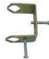
A-FRAME MOUNT FOR TV MAST 042664

Universal "A" frame clamp to fix antenna mast to caravan "A Frame".