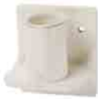
FOLDAWAY ANTENNA MOUNTING BRACKET 002281

Replacement bracket for Foldaway Antennas (refer codes 002277 and 002278).