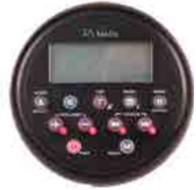
RV MEDIA FULLY WATERPROOF WIRED REMOTE CONTROL 041842

For use with the RV Media 0471842 wired remote.