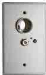
JACK 12V INJECTOR SOCKET 21253 040863

Combined F-connector antenna plug and 12V outlet socket. Also injects power in to the antenna lead for amplified antennas. Works with most brands of amplified antenna.