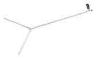
FOLDAWAY TALLBOY ANTENNA TO SUIT WIND UP CAMPER 002277

Suitable for use on vans, pop tops and wind-up campervans.