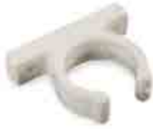
FOLDAWAY ANTENNA UPPER MOUNT CLIP 002282

Replacement bracket for Foldaway Antennas (refer codes 002277 and 002278).