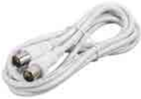
COAX LEAD 1.8M DOUBLE ENDED STANDARD (HOME STYLE) TV LEAD 002339