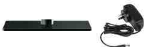
19" EVOLUTION ACCESSORY PACK 044571

Includes a 240V plugpack power supply and desktop stand to suit Evolution 19" TV's only.