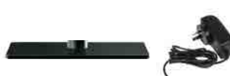
22 & 24" EVOLUTION ACCESSORY PACK 044572

Includes a 240V plugpack power supply and desktop stand to suit Evolution 19" TV's only.