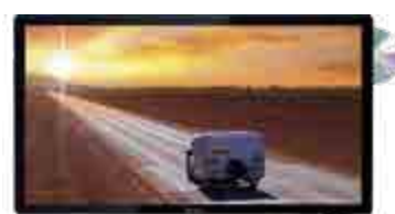
RV MEDIA EVOLUTION TV - 19" 044477