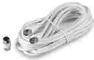
COAXIAL 4.5M LEAD (HOME STYLE LEAD) 035134