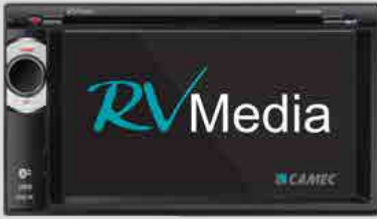
RV MEDIA 6.2" TOUCH SCREEN DVD/CD/USB PLAYER FOR RV'S 043431