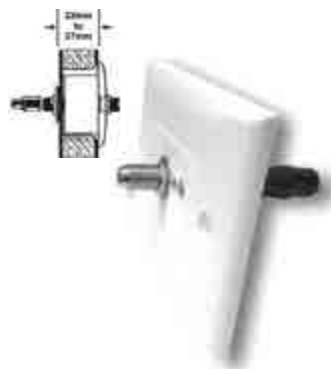
EXPLORER WALL CONNECTOR 19-32MM SPACE THROUGH WALL 002374

Combined F-connector antenna plug and 12V outlet socket. Also injects power in to the antenna lead for amplified antennas. Works with most brands of amplified antenna.