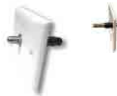
EXPLORER PASSIVE THROUGH CONNECTOR PC6A 002378

Connection upgrade to a "PASSIVE" kit - for use with any antenna. These connections will improve performance for TV and satellite signals in the 120Mhz to 840Mhz range.