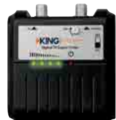
SURELOCK ANTENNA SIGNAL METER SL1000 040286

SureLock is a digital TV signal meter that enables you to pinpoint the location of television towers prior to scanning for television channels.