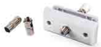
COAXIAL THROUGH THE WALL KIT 002382