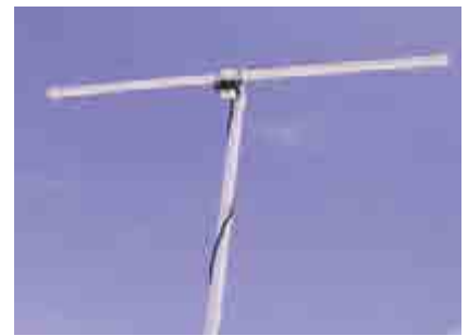
HAPPY WANDERER-POP TOP ANTENNA 002287

Simple to erect and stow. Tunes to horizontal and vertical polarised signals and can pick up UHF/VHF TV, FM radio and digital signals.