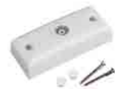
COAXIAL DEEP TV SOCKET WHITE (1A/770/TVCCM X) 002394

Connection upgrade to a "PASSIVE" kit - for use with any antenna. These connections will improve performance for TV and satellite signals in the 120Mhz to 840Mhz range.