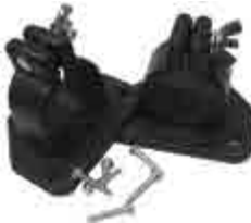
EXPLORER SIDE MOUNT BRACKETS 002372

Side mounts to suit 32mm aluminium, wood or conduit masts. Ideal for all types of caravans, boats, horse trucks, etc.