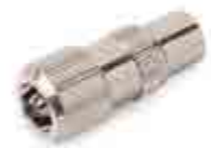
COAXIAL PLUG MALE CHROME STEEL 002384