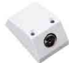
COAXIAL SURFACE SOCKET EXTERNAL 002390