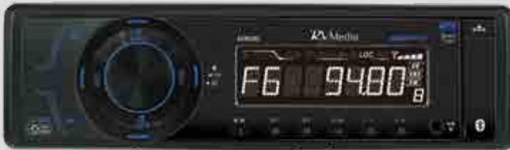
RV MEDIA AUM1000 AM/FM MECHLESS USB/SD TUNER WITH APP CONTROL 041840

Exclusively designed for the RV industry.