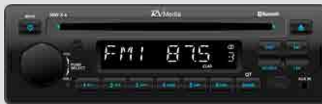
RV MEDIA BLUETOOTH CD/USB AM/FM TUNER 044377

Designed specifically for RVs, the new RV Media Bluetooth CD/ Tuner features an easy to read LCD screen and large buttons with an uncluttered layout which is easy to use.