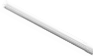
FOLDAWAY ANTENNA EXTENSION ARM 002280

To suit Foldaway Antennas (refer codes 002277 and 002278).