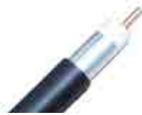
COAXIAL TV CABLE 75OHM 002336