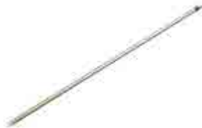
TV MAST GALVANISED 2 PIECE TELESCOPIC 002358