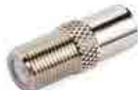
ADAPTER - F TO PAL 040845