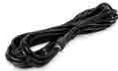
RV MEDIA 6 METRE EXTENSION CABLE 041846

For use with the RV Media 0471842 wired remote.