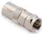
COAXIAL ADAPTER (FOR USA ANTENNA) 002387

To suit USA Wall Plate - female connector to standard TV lead.