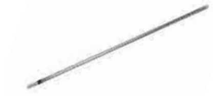
CAMLOCK TV MAST ALUMINIUM - 32MM 002356

Aluminium Camlock action. Lightweight and compact.