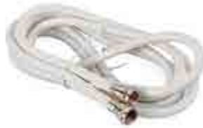
COAXIAL 1.8M FLY LEAD 040842