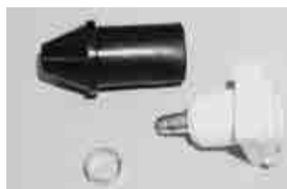
COAXIAL MECHANISM (30TV75M) 002392