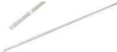
CAMLOCK TELESCOPIC MAST ALUMINIUM - 25MM 035132

Connects antenna directly to the TV to avoid breaks in the connection.