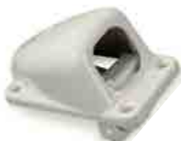
COAXIAL ANGLE SOCKET (30TV75S) 002389