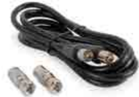
TV FLY LEAD 1.5M STANDARD AND FEMALE CONNECTOR 040844