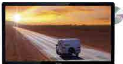
RV MEDIA EVOLUTION TV - 24" 044478

As most RV TV's are mounted on the wall and operate from the RV's 12V system, RV Media Evolution Series TV's are not supplied standard with a stand and 240V plugpack that in most cases are not used. This ensures that this Premium TV is produced using only A-Grade LCD panels and premium components that have been specifically sourced and developed for the Australasian RV environment. Should you require a desktop stand or 240V plugpack, please order one of the appropriate TV Accessory Kits listed below.