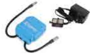
FOLDAWAY ANTENNA AMPLIFIER 240 VOLT 002285

Replacement upper mount clip for Foldaway Antennas (refer codes 002277 and 002278).