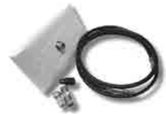
EXPLORER PLATE FLYLEAD AND CONNECTOR PASSIVE 002344

Ideal for satellite or Foxtel or any brand of antenna.