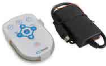
RV MEDIA RF WIRELESS REMOTE CONTROL 041843

Enjoy easy operation of your RV Media head unit from up to 10M away! Works anywhere inside or outside the RV - as there is no need to point it directly at the head unit. Also features an in-built LED torch. Suits RV media head units - 041840 and 043431.