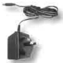
EXPLORER POWER SUPPLY 002345

Power supply for explorer antenna system. C2 C3 C10 or C3sg, in fact any genuine Explorer system.