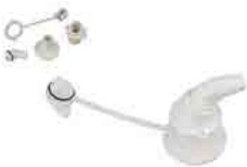
THRU THE WALL DIRECT CONNECT TO SUIT COAXIAL CABLE 034974

Connects antenna directly to the TV to avoid breaks in the connection.