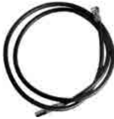
EXPLORER 3M FLY LEAD TO SUIT ANTENNA KIT 002350

For that extra distance between the antenna socket and where you want the view the TV.