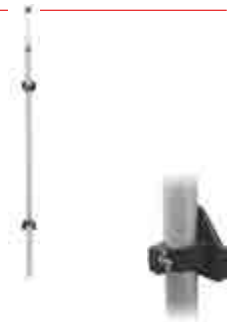
SIDE MOUNT KIT AND 2 PIECE, 2.8M MAST 002370

To suit Explorer Antenna. Side mounts are recommended when access to the drawbar is restricted.