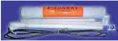
FOLDAWAY STANDARD ANTENNA 002278