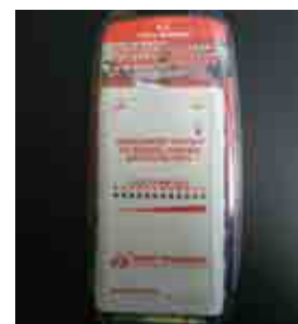
HAPPY WANDERER TV SIGNAL FINDER 039318

This unit is ideal for antennas that don't have their own booster or signal finder.