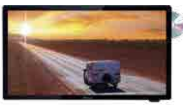
RV MEDIA EVOLUTION TV - 22" 044695