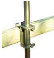
EXPLORER STANDARD DRAW BAR MOUNT 002361

Heavy duty, galvanised, suits "standard" draw bar (4in/100mm).