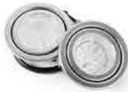
REPLACEMENT LED DOWN LIGHT SHORT LEAD (PCB SIDE) TO SUIT CAMEC 12V RANGEHOOD (REFER CODE 040864) 041762 Each.