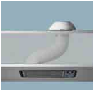
ELECTROLUX FLUSH MOUNT RANGEHOOD 12V CK150 017022