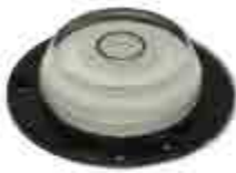
CAMEC FRIDGE BULLS EYE LEVEL 042670

Clear plastic level which can be used on any flat surface.