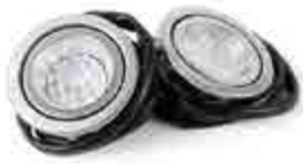
REPLACEMENT LED DOWN LIGHT LONG LEAD TO SUIT CAMEC 12V RANGEHOOD (REFER CODE 040864) 041751 Each.