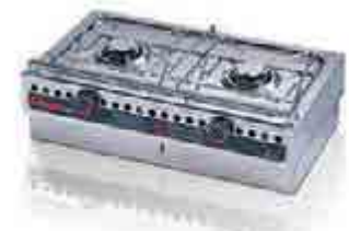
ORIGO METHO BENCHTOP STOVE (OH3000) 035712

Double burner free standing alcohol stove.