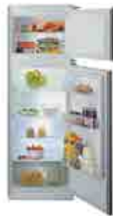
VITRI C220DP DOUBLE DOOR 220L 12-24 VOLT FRIDGE FREEZER 044465 LEFT HINGE 044466 RIGHT HINGE

Sea white range fridge freezer with double door for larger refrigerated spaces..