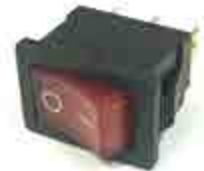
SWITCH FOR CAMEC RANGEHOOD 003513

Note: This switch will illuminate for the 12V rangehoods.