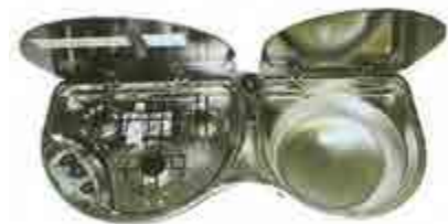
SMEV 3 BURNER/HOTPLATE AND RIGHT HAND SINK WITH GLASS LIDS (NO TAP) 040853

Space saving stainless steel design with folding glass lids.