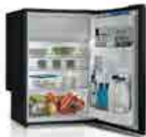
VITRI C115I FRIDGE FREEZER 118 LITRE 12-24 VOLT WITH FITTING FRAME AND AIR LOCK 043587

Built in fridge/freezers suitable for RV and marine use complete with Air Lock.