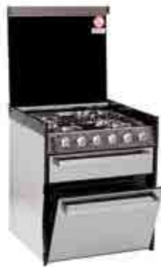
SMEV STAINLESS STEEL 4 BURNER GAS-ELECTRIC GRILL AND OVEN 040600

400 Series. Compact oven, grill and burner with mirror door ideally suited to caravan and recreational vehicle use. Flush mounted with your bench top to provide additional bench space when not in use.