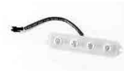
REPLACEMENT SWITCH PANEL TO SUIT CAMEC 12V RANGEHOOD (REFER CODE 040864) 041753