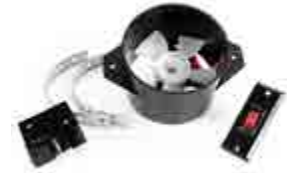
FRIDGEMATE 12V FRIDGE FAN 000688

This solar panel suits the Solar fridge fan (refer code 000684).