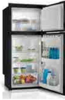
VITRI DP2600 BLACK 2 DOOR FRIDGE/FREEZER 230 LITRE 12-24 VOLT BD-50 COMPRESSOR WITH FITTING FRAME AND AIR LOCK 043659

These 2-door refrigerators have huge capacity and feature large separate freezer compartments for long term storage of frozen foods. The DP2600i, has a flush mount surround for ease of installation and also has the Air Lock catch system as standard equipment. The cooling unit is mounted directly onto the refrigerator cabinet.