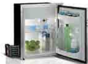
VITRI C75 STAINLESS STEEL FRIDGE 75 LITRE 12-24 VOLT AND EXTERNAL COMPRESSOR WITH STEELOCK 043611 C75LX FRIDGE ONLY FLUSH MOUNT 044192 C75LX FRIDGE/FRZR WITH HOLDING PLATE

Built in fridge with external cooling unit which allows the compressor to be located in a cupboard or other convenient place with sufficient ventilation. Length of connection pipe is approx. 1.6m.