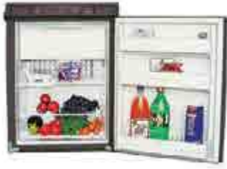
DOMETIC FRIDGE 3 WAY 90 LITRE RM2350 003187

Manual control model absorption refrigerator for 12/240Vs and gas. Single-curved door model.