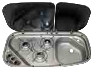
CRAMER COMBI 3 BURNER HOB WITH SINK 043452