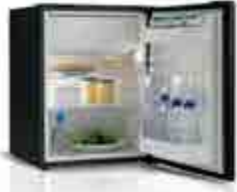
VITRI C60I FRIDGE 60 LITRE 12-24 VOLT WITH FITTING FRAME AND AIR LOCK 043584

Exclusive to Camec, Vitrifrigo is leading worldwide company specialising in industrial refrigeration. Vitrifrigo utilises advanced research and development programs to provide high-quality design, functionality and performance of every product.