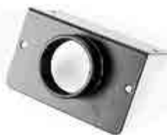
OUTLET ADAPTOR TO SUIT CAMEC 12V RANGEHOOD - REFER CODE 040864 041132

Note: This switch will illuminate for the 12V rangehoods.