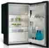
VITRI C85I FRIDGE 90 LITRE 12-24 VOLT WITH FITTING FRAME AND AIR LOCK 043583

Built in fridge/freezers suitable for RV and marine use complete with Air Lock.