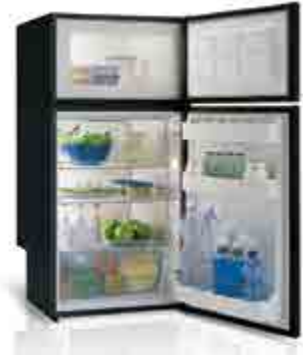
VITRI DP150I 2 DOOR FRIDGE 150 LITRE 12-24 VOLT AND BD-50 COMPRESSOR WITH FITTING FRAME AND SWING LOCK 002989

These 2-door refrigerators represent the pinnacle of excellence within the Vitrifrigo range. They have huge capacity and feature large separate freezer compartments for long term storage of frozen foods.