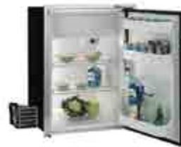
VITRI C130LX FRIDGE 130 LITRE 12-24 VOLT AND EXTERNAL COMPRESSOR WITH STEELOCK 043992

Built in fridge with external cooling unit which allows the compressor to be located in a cupboard or other convenient place with sufficient ventilation.