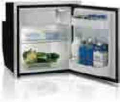
VITRI C62IX STAINLESS STEEL 12/24V 62L FRIDGE FREEZER WITH STEELOCK 044008

Built in fridge/freezers suitable for RV and marine use complete with Steelock.