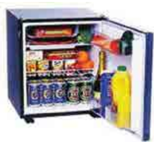
ENGEL FRIDGE FREE STANDING 80 LITRE ST90F 003204

Large capacity 80 litre free-standing fridge that incorporates a separate freezing compartment. Cleverly designed to fit into confined spaces in caravans and boats. Unique auto switching between 12/24V DC and 240V AC standard in most of Engel's uprights SR48F, SR70F, ST68E, SR90E. Reversible door and replaceable door panel so you can customize your refrigerator to match your vehicle's interior. Turbo fan standard.