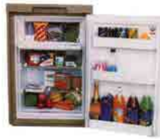
DOMETIC 3 WAY FRIDGE 120 LITRE MANUAL ENERGY SELECTOR RM2453 003189