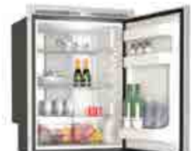
VITRI C180RFX 180 LITRE 12-24 VOLT STAINLESS STEEL FRIDGE ONLY AND EXTERNAL COMPRESSOR WITH STEELOCK 044567

Built in fridge with external cooling unit which allows the compressor to be located in a cupboard or other convenient place with sufficient ventilation.