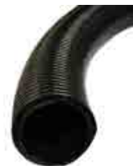
CAMEC RANGEHOOD DUCT TUBE BLACK 042359

Outlet Adaptor for Camec 12V Rangehood (refer code 040864).