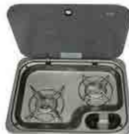
DOMETIC CRAMER COOK TOP 040264 2 BURNER COOK TOP

The Dometic Cramer hob features an integrated heat-resistant safety glass lid, detachable chromed pan supports, stainless steel burner caps, safety ignition system, recessed controls and a low profile rubber seal. If there are no pots on the hob, you can close the glass lid to gain additional work space - and protect the hob at the same time.