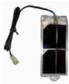
SOLAR FRIDGE FAN - SOLAR PANEL 000685

Solar powered exhaust fan increases the cooling efficiency of refrigerator by venting hot air from the coils.