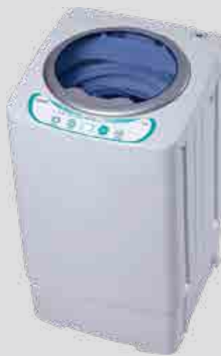
CAMEC COMPACT RV 3.0KG WASHING MACHINE 044131

Our latest top load washing machine features a larger 3kg washing capacity and is the only machine in its class to offer an optional hot wash cycle using cold water (this feature adds approximately 20-40 min to the cycle time). And our exclusive LED drum light will help you find that missing sock!