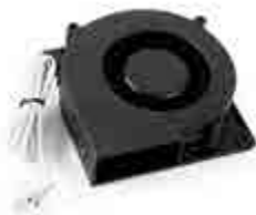
REPLACEMENT FAN TO SUIT CAMEC 12V RANGEHOOD (REFER CODE 040864) 041477