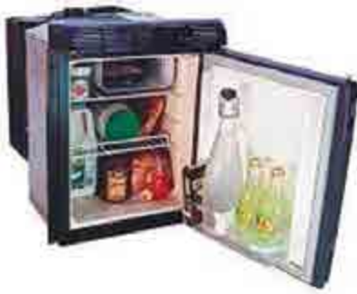
ENGEL FRIDGE 40 LITRE SR48F 003199

Affordable, extremely compact built-in refrigerator that will provide more than adequate storage capacity when space is at a premium. Built-in 12V, 24V and 240V. Reversible door and replaceable door panel so you can customize your refrigerator to match your vehicle's interior. Turbo fan standard.