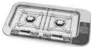
ORIGO METHO 2 BURNER RECESS STOVE OH4100 035713