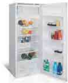
VITRI C220MP SINGLE DOOR 235L 12-24 VOLT FRIDGE FREEZER 042338

Sea white range fridge freezer with single door for larger refrigerated spaces..