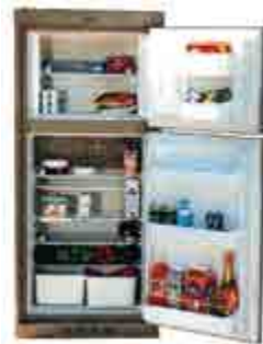
DOMETIC 3 WAY FRIDGE 184 LITRE RM4601 003193