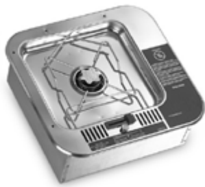
ORIGO 1 BURNER SPIRIT STOVE FLUSH 2000 002873