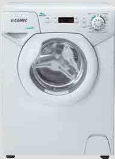
COMPACT RV 4KG FRONT LOAD WASHING MACHINE 042308

With a large 4kg capacity for its size, you can now enjoy all of the features and wash modes you are accustomed to with your home machine, right in your RV. Requiring only a cold water supply hot water washing is possible using the machine's in-built heater element.