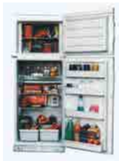
DOMETIC FRIDGE 2 WAY 220 LITRE RGE410 003194

The Dometic RGE410 large capacity gas and electrical refrigerator/freezer has a total capacity of 220 litres including a separate frozen food compartment of 45 litres offering maximum storage volume.