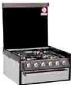
SMEV 4 BURNER GRILL GAS WITH MIRROR DOOR AND SAFETY CUT OFF 040601

400 Series. Compact grill and burner with mirror door ideally suited to caravan and recreational vehicle use. Flush mounted with your bench top to provide additional bench space when not in use.