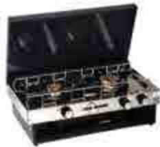
LIDO JUNIOR 2 BURNER AND GRILL 002721

No flame arrest. Suitable for camping and outdoor use.