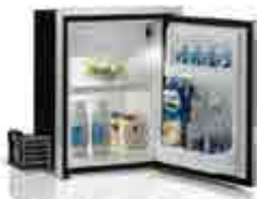
VITRIFRIGO C42LX STAINLESS STEEL 42L 12/24V FRIDGE WITH STEELOCK 044193

This 42 litre stainless steel refrigerator and freezer features Steelock locking system.