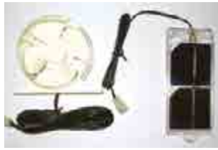
SOLAR FRIDGE FAN 000684

Clear plastic level which can be used on any flat surface.