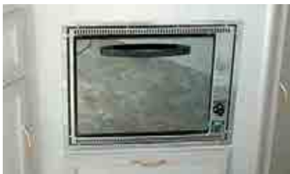
SMEV OVEN AND GRILL 040941

Featuring a grill that is an integral part of the oven space allowing the oven to be located below the cook top.