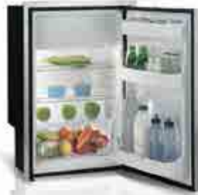
VITRI C115IX STAINLESS STEEL 12/24V 115L FRIDGE FREEZER WITH STEELOCK 042426 LEFT HAND HINGE NO FREEZER/CRISPER 042427 LEFT HAND HINGE NO FREEZER 042428 RIGHT HAND HINGE NO FREEZER

Built in fridge/freezers suitable for RV and marine use complete with Steelock.