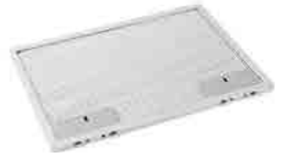
REPLACEMENT FILTER TO SUIT CAMEC 12V RANGEHOOD (REFER CODE 040864) 041755