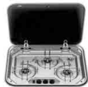
SMEV 3 BURNER DROP-IN HOTPLATE AND GLASS LID 040393

The 3 burner version of the Smev 8000 Series cookers complements the matching stainless steel sink and oven.