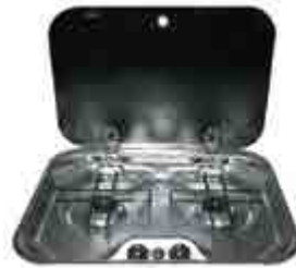
SMEV 2 BURNER/HOTPLATE STAINLESS STEEL DROP-IN WITH GLASS LID 040321

8000 Series stainless steel with glass fold-down lid and compact design. This model features flame failure protection on both burners, therefore if the flame blows out, the gas will stop flowing to that burner.