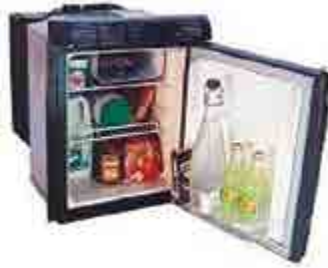
ENGEL BUILT IN FRIDGE 40 LITRE SB47F 003200

Affordable, extremely compact built-in refrigerator that will provide more than adequate storage capacity when space is at a premium. Built-in 12/24v only. Reversible door and replaceable door panel so you can customize your refrigerator to match your vehicle's interior. Turbo fan standard.