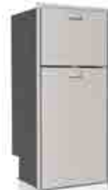
VITRI DP2600IX STAINLESS STEEL 2 DOOR FRIDGE/FREEZER 230 LITRE 12-24 VOLT BD-50 COMPRESSOR WITH FITTING FRAME AND STEELOCK 043983

These 2-door refrigerators have huge capacity and feature large separate freezer compartments for long term storage of frozen foods. The DP2600ix, has a flush mount surround for ease of installation and also has the Steelock catch system as standard equipment.