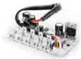
REPLACEMENT CIRCUIT BOARD TO SUIT CAMEC 12V RANGEHOOD (REFER CODE 040865 & 040864) 044467