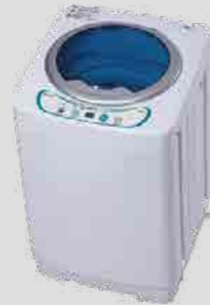
CAMEC COMPACT RV 2.5KG WASHING MACHINE 041133

Ideal for caravans and motorhomes, this easy to use fully automatic RV washing machine offers washing convenience wherever your travels take you. Featuring simple controls and flexible washing modes, you have the convenience of washing when you want.