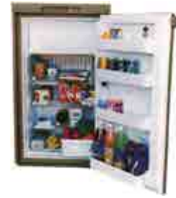
DOMETIC 3 WAY FRIDGE 150 LITRE RM2553 003190