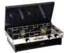
LIDO JUNIOR 2 BURNER AND GRILL SUITABLE FOR RVS OR BOATS 040326

Suitable for indoor use in caravans and motorhomes. Can also be used for camper trailer and outdoor kitchens.