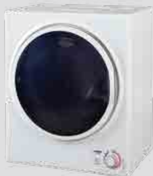
CAMEC COMPACT RV 3.2KG DRYER 041834

Ideal for caravans and motorhomes, this compact RV Dryer offers drying convenience wherever your travels take you. Featuring simple operation, it is the perfect partner for the Camec 4kg front load washing machine.