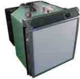
ENGEL BUILT IN FRIDGE 55 LITRE SR70F 003201

Compact built in fridge with an area for frozen goods, to suit most campervans or yachts. Maximization of storage capacity allows you to separate beverages and perishables easily. Auto switching between 12/24V DC and 240V AC. Reversible door and replaceable door panel so you can customize your refrigerator to match your vehicle's interior. Turbo fan standard.