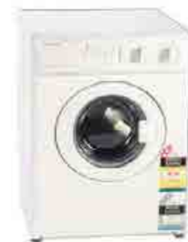
DOMETIC FRONT LOAD WASHING MACHINE WMD1050 033474