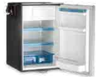
DOMETIC WAECO CRX-140 135 LITRE FRIDGE 044317